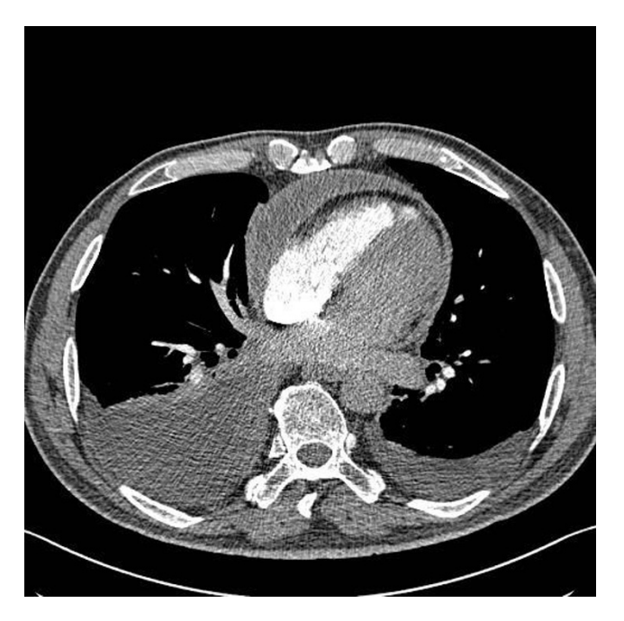
Figure I CT Chest showing thickened pericardium.

He was transferred to a tertiary centre where he received a complete pericardectomy and coronary artery bypass grafting. The histology of the resected pericardium and lymph nodes showed no evidence of malignancy or tuberculosis and with no significant medical history the diagnosis of idiopathic constrictive pericarditis was made. He