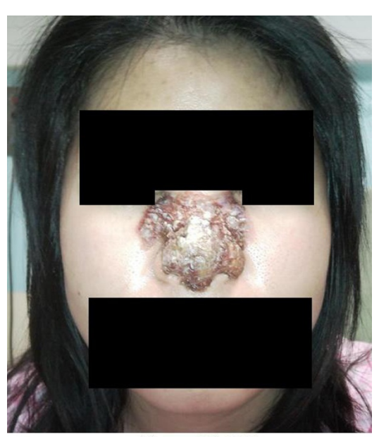
February 13th 2009

Herpes simplex virus has two subtypes; HSV1 is more common and generally causes ulceration around the mouth or nose known as cold sores whereas HSV2 is more likely to cause genital lesions. Via a similar pathological