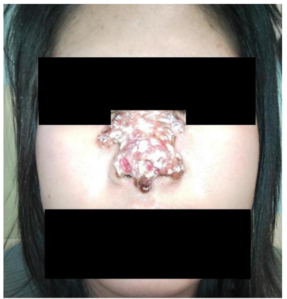
February 16th 2009

mechanism to varicella zoster, there is the possibility of latent and recurrent disease. Following primary infection the virus lies dormant in dorsal root ganglia of sensory nerve fibres. In response to a number of possible triggers the immune system is no longer able to contain latent