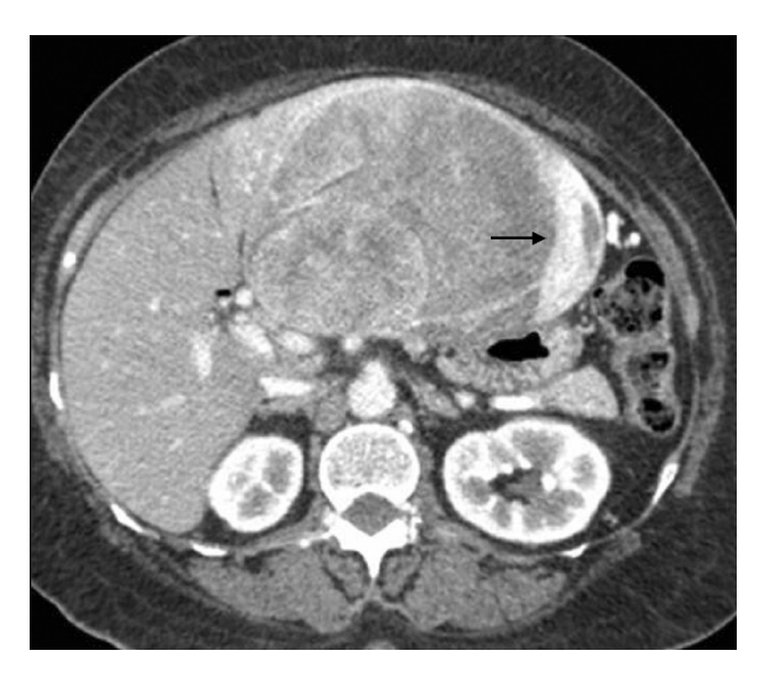
Figure I Portal-stage contrast-enhanced helical CT of the upper abdomen. Impregnation by the contrast agent shows a large, solid, exofitic lesion compromising the left liver lobe. The enhancement is intense and heterogeneous, the dominant portion being in the periphery of the lesion (arrow).

Computed tomography (CT) of the upper abdomen (Figure 1) showed a heterogeneous lesion – measuring 15 \times 14 \times 10 cm – with a partially well-defined margin and hypodense permeating areas, some with attenuation values compatible with soft parts, and others with liquefaction located in the left liver lobe. After endovenous contrast injection, the lesion showed intense and non-