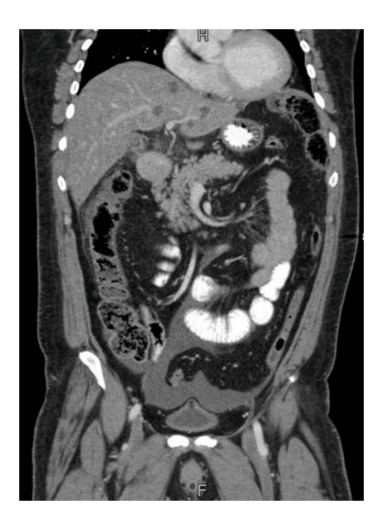
Figure 2 Sagittal section of abdominal CT scan showing pericholecystic fat stranding, and mild fluid in the pelvis.

Our case is unusual because our patient was younger in comparison, had no prior history suggestive of gallbladder disease and had no known medical co-morbidity. Histopathological examination of the specimen showed features of acute-on-chronic cholecystitis leading to the derivation that the prior episodes of cholecystitis in this patient were clinically silent. Per-operatively our patient's gallbladder showed dense adhesions with the surrounding structures and no signs of gangrene of the rest of the gallbladder. This further strengthens the possibility of clinically covert episodes of acute cholecystitis in the past due to the adhesions noted; however the patient denied any past history of abdominal pain. The gallbladder perforation in our case presumably occurred within the first 12-18 hours of the onset of symptoms. In addition, the perforation occurred at the neck of the gallbladder which is an uncommonly reported site for such an event. The most common sites for the perforation of the gallbladder are the fundus and the body of the gallbladder due to