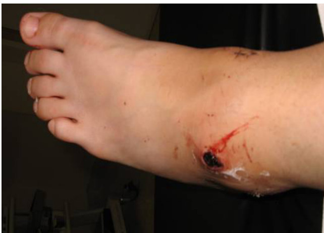
Figure 1 Preoperative Photograph-Pulsatile pseudoaneurysm following ankle arthroscopy at antero lateral portal.

The patient was referred to the vascular team and underwent an urgent exploration. Intra-operatively, the findings were pulsatile mass with necrotic tissue, a moderately large cavity of pseudo aneurysm filled with fresh blood clots. The distal anterior tibial and dorsalis pedis arteries were isolated. The distal anterior tibial and proximal dor-