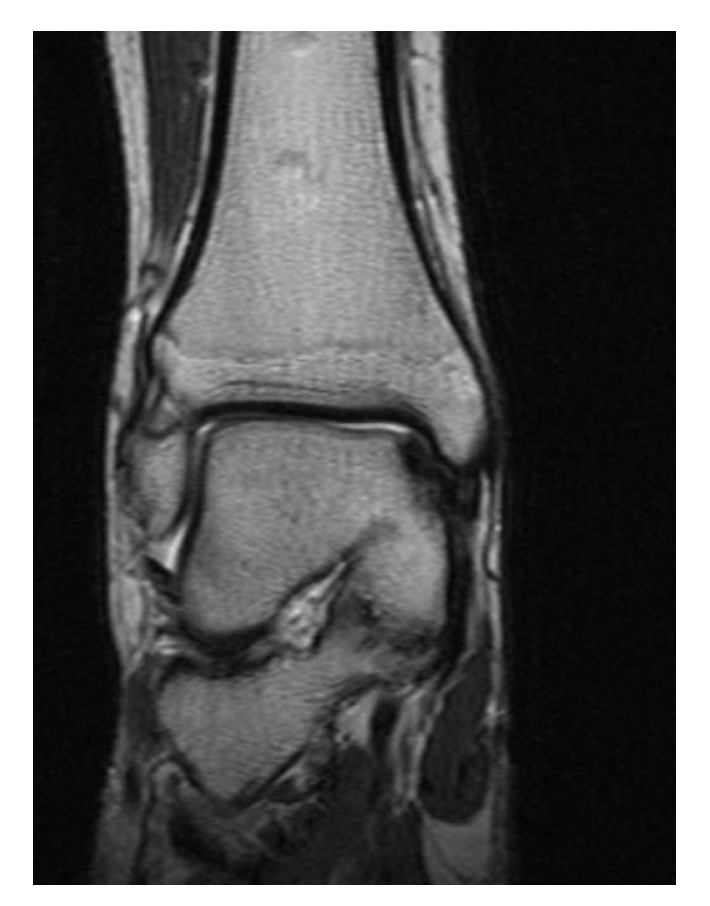
Figure 3 3D coronal CT of the ankle and hid foot showed significant talocalcaneal coalition.

the vena cava through a side-to-side, extrahepatic communication. In addition to this classification, there is a clear clinical distinction between patients with type I and type II shunts based on the analysis of the reported cases. Type I shunt, is almost congenital, such patients are young girls at the time of presentation. Despite the presence of high ammonemia, encephalopathy is usually not so marked in these patients. Type II shunt is acquired rather than congenital, patients are usually presented with the disorder at a middle or late-middle age. Encephalopathy with high serum ammonia level of unknown cause and a vascular anomaly discovered via vigorous investigations do occur [9].