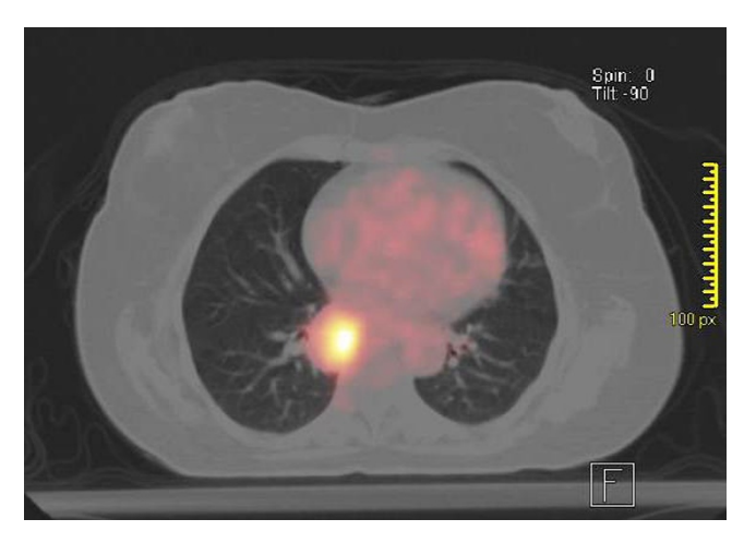
Figure 2 PET CT scan of chest showing increased uptake in nodules.

chronic inflammation and necrotizing vasculitis (Fig 3). Biopsy specimen examined for aerobic and anaerobic bacteria, acid fast bacilli and fungus, was negative on smear and culture. A complete vasculitis panel was obtained which included antinuclear antibodies, anti-dsDNA, anti-Smith, anti-SSA and SSB, anti-histone antibody, anti-Jo-1, anti-centromere antibody, anti Scleroderma -70, anti-proteinase 3 and anti-myeloperoxidase antibodies along with the antineutrophil cytoplasmic antibodies (ANCA). The only positive tests were an elevated cANCA in a titer of 1: 640 (Normal less than 1: 20) and anti-proteinase 3 antibodies of 118 units (Normal 0 – 20 units).