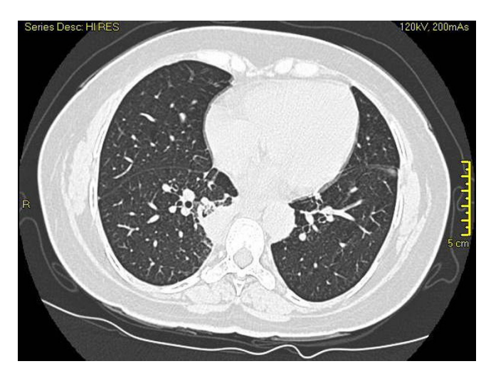
Figure I High resolution CT scan of the chest showing the lung nodules.

Her white count was 7.8 \times 10^9 /l with neutrophils of 84%. The ESR by Westergren's method was 46 mm at the end of one hour. A comprehensive metabolic profile was normal and urine analysis did not show any sediment. Her chest radiograph showed streaky infiltrates at the right base. A high resolution CT scan showed three lung nodules (Fig 1). An FDG PET scan was done which showed avid uptake in all the nodules with an SUV value of 8 (Fig 2). A CT-guided lung biopsy of the right lung nodule was performed. The lung biopsy showed fibrosis with acute and