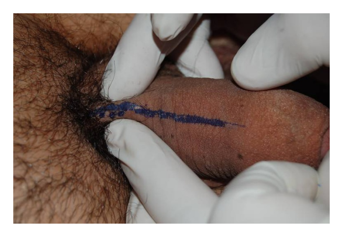
Figure I Superficial trombosed dorsal vein.

vein as well as the lack of venous flow signals in Doppler ultrasonography (Figure 2).