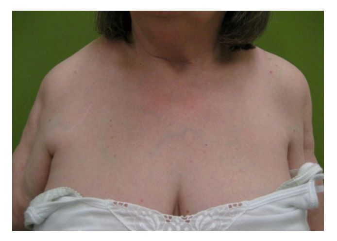
Figure 2 Frontal view of the patient with a manifest reduction of upper arm muscles.

Despite the slightly increased serum creatinkinasis and the symmetric atrophy of identical muscles pointing to a muscular dystrophy of the limb girdle type [1], the diagnosis needed further examination using light microscopy and immunohistochemistry of affected muscles. Therefore we performed an incision biopsy of the right deltaand biceps-muscle to ensure diagnosis. The different samples were kept in formaline, in kryo-fixation, and before being embedded in plastic, in glutaraldehyde.