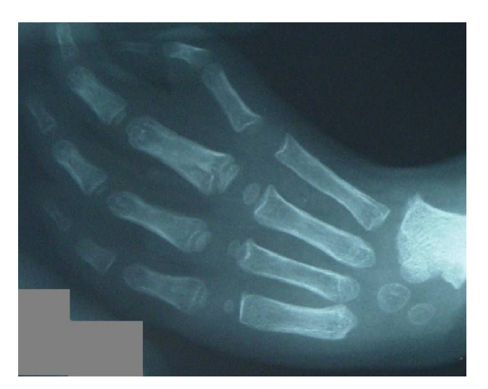
Figure 1 Anteroposterior radiograph of the hand showed the absent thumb.

At the age of 4 years Ilizarov technique was performed to correct the lower limb defects (Distraction osteogenesis, this refers to the induction of new bone between bone surfaces that are pulled apart in a gradual, controlled man-