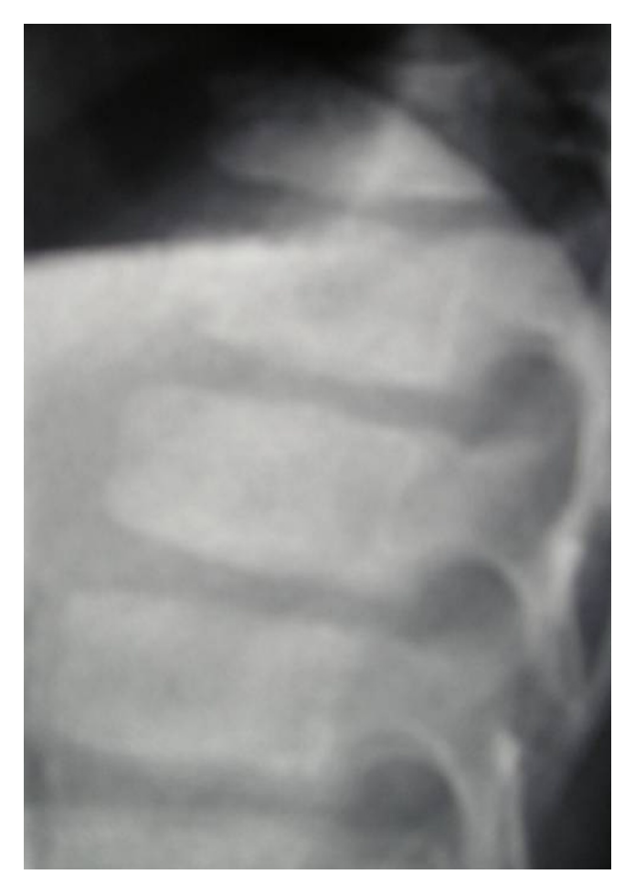
Figure 2 Lateral spine radiograph showed platyspondyly associated with anterior clefting of the vertebrae.

of children with Pierre Robin association had Stickler syndrome. Holder-Espinasse et al., [11] also found that about 15% of cases presenting at birth with Pierre-Robin syndrome had Stickler syndrome. Radiological examination at this time may reveal coronal clefts of the vertebrae, mild platyspondyly and flaring of the metaphyses of the long bones (features of the Weissenbacher-Zweymuller syndrome). As the child grows older these features become normal, although a mild epiphyseal dysplasia may develop. Weissenbacher-Zweymuller syndrome has been described as "neonatal Stickler syndrome," but is actually a distinct entity [12]. It is characterized by midface hypoplasia with a flat nasal bridge, small upturned nasal tip, micrognathia, sensorineural hearing loss, and rhizomelic limb shortening. Radiographic findings include dumbbell-shaped femora and humeri and vertebral coronal clefts. The skeletal findings become less apparent in later years, and catch-up growth after age two to three years is common [5].