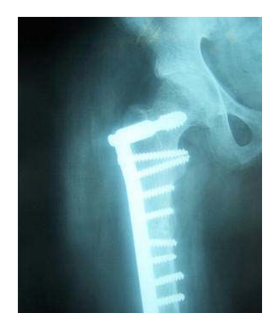
Figure 3 Showing the fracture status at three years follow up.

advantage of giving a good hold in the femoral neck area by virtue of its position while avoiding complications of pull out. Cancellous screws were used to improve the hold further.