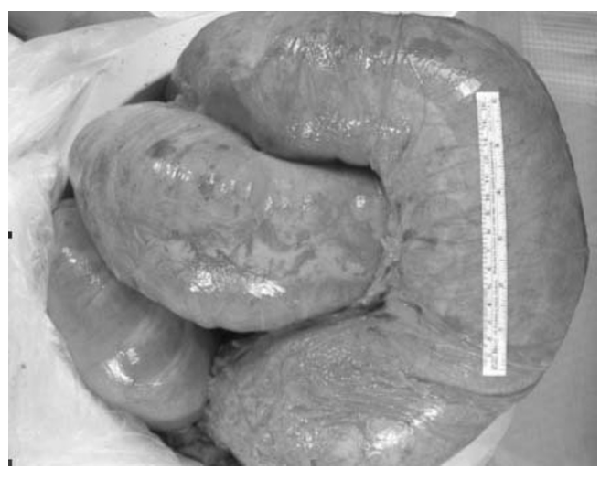
Figure 3 Gross specimen post-colectomy.

Intraoperative findings demonstrated a rotation of the transverse colon on its mesentery, causing a closed loop obstruction. The volvulus was delivered into the incision and detorsed (Figure 3). The entire colon – from the cecum to the sigmoid colon – appeared massively dilated. We performed an extended right hemicolectomy with a Brooke ileostomy. The patient made a satisfactory recovery and was discharged from the hospital six days later.