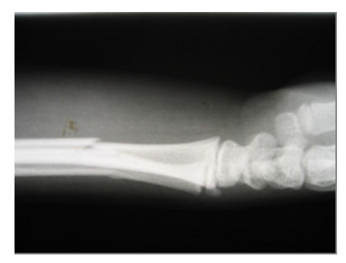
Figure I Plain radiographs of the forearm demonstrated a non-displaced both-bone radius and ulnar fracture.

Radiographs demonstrated adequate alignment, a healing fracture and a good periosteal callus. Ultrasound was consistent with pseudoaneurysm of the right radial artery. Brachial angiography was performed to the patient. False aneurysm of distal radial artery was observed (Figure 2).