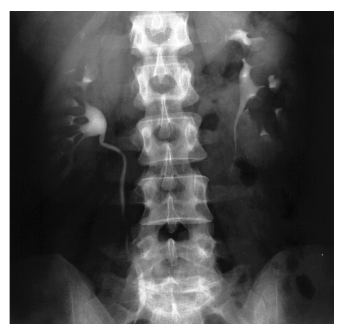
Figure 2 Stretching of calyces seen at IVU.

The terms peripelvic and parapelvic generally describe cysts around the renal pelvis or renal sinus [3]. In practice,