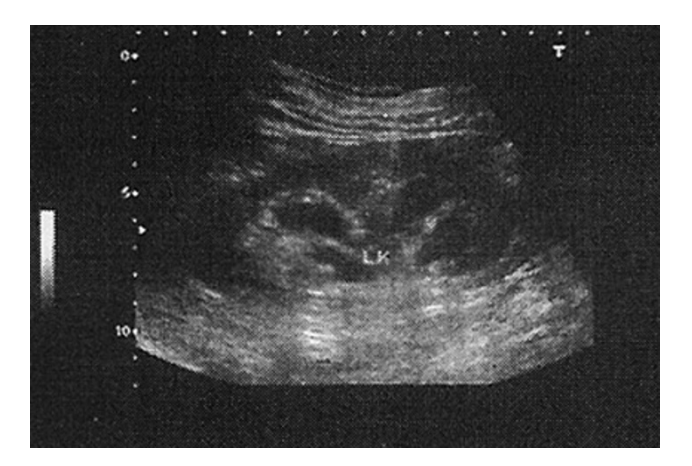
Figure I Hydronephrosis appearance in sonography.

IVU also was performed and showed normal-looking fornices but stretched infundibuli (Figure 2). Then abdominal CT scans with and without contrast were implemented. The non-enhanced CT scan demonstrated dilated calyces and pelvises bilaterally, and no septa were observable (Figure 3A, B). Surprisingly, the CT scan with contrast showed multiple, bilateral parapelvic cysts (Figure 3C, D).