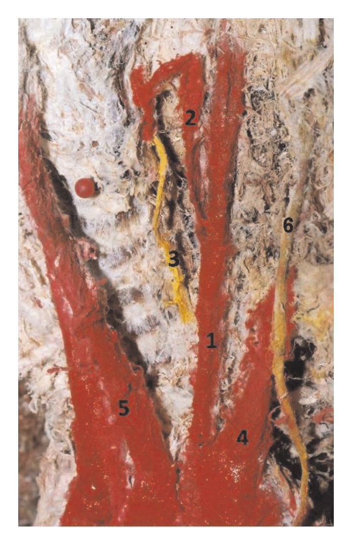
Figure 1. Cadaveric photo after highlighting in colour the anatomical structures of interest. Left vertebral artery (1) arising from the root of the left subclavian artery (4), close to the aortic arch and behind the left common carotid artery (5). The left inferior thyroid artery (2) originates from the left vertebral and supplies the thyroid gland. The recurrent laryngeal nerve (3) originating from the vagus nerve (6) can also be seen emerging behind the inferior thyroid artery.

having an upward and to the midline course. Carefully dissecting this smaller artery from the surrounding connective tissue we reached the thyroid gland, concluding that it was the inferior thyroid artery. The recurrent laryngeal nerve was found deep to it and it was also revealed. The observations were photographed and documented on diagrams (Figures 1 and 2).