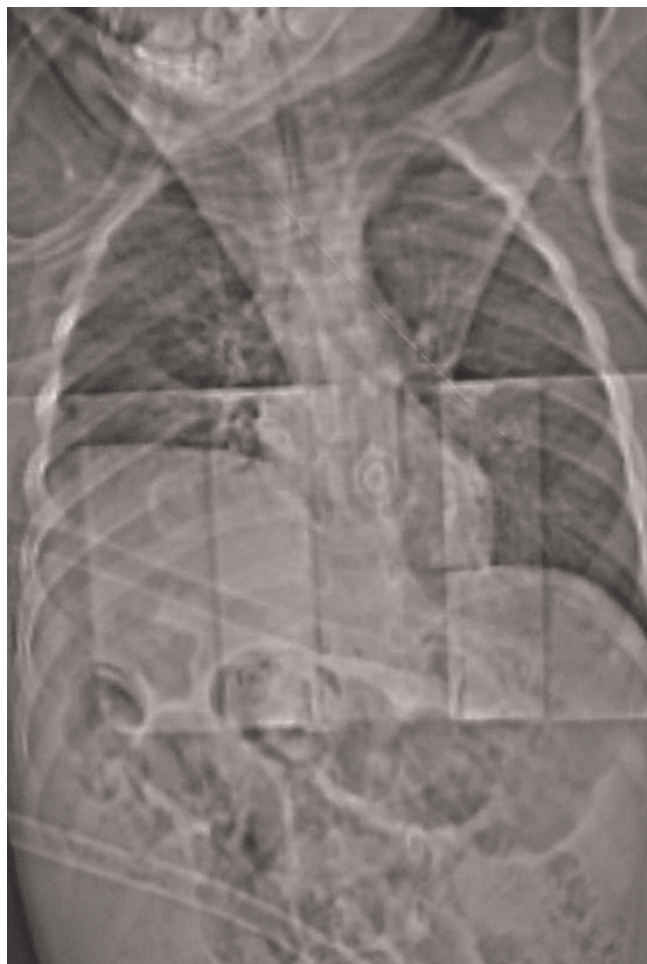
Figure 1. X-ray chest showing elevated right dome of diaphragm.

After resuscitation the patient was taken for CT scan of abdomen and chest. CT showed free fluid in the abdominal cavity, a right sided retroperitoneal haematoma, a right lung contusion, a right haemothorax and the presence of right sided chest tube (Figure 1). The