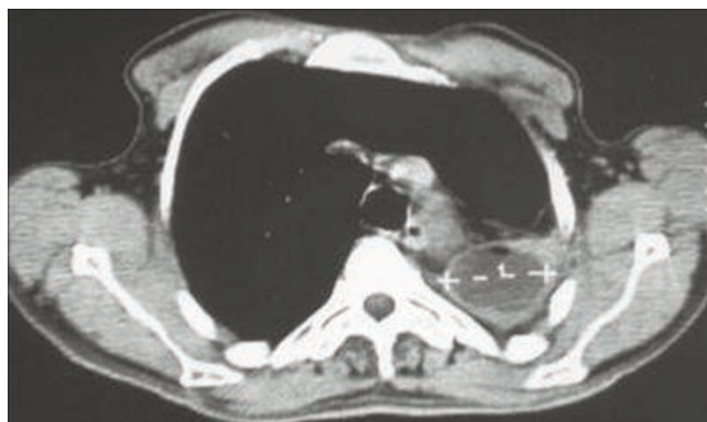
Figure 2. Computed tomography (CT) scan showing pleural pocket.

did not reveal any malignant cells or Koch's bacillus, and culture of the sputum turned out to be negative. Preoperatively, the diagnosis of endobronchial lipoma associated to chronic cystic bronchiectasis complicated by pleural effusion was suggested. A left posterolateral thoracotomy was performed; a pleural pocket was opened, bringing out a purulent fluid. Cutting the left main bronchus revealed a smooth and yellow tumor. Because of the irreversible damage to the left lung, a pneumonectomy was performed. Macroscopic examination of the resected specimen showed a sessile mass measuring 1.5 cm, attached to the bronchial mucosa, and cystic bronchiectasis. Microscopically, the endobronchial tumor mainly contains a mature fatty tissue surrounded by respiratory epithelium; whereas the submucosa contains a moderate number of chronic inflammatory cells. Consequently, the tumor was diagnosed as an endobronchial lipoma (Figure 3). In the pleural fluid, a