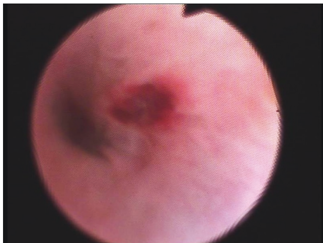
Figure 1. Endoscopic view of the hemangioma of the penile urethra in the patient.

Urethral hemangiomas can occur at any age. Most cases are encountered in males and only a few have been reported in female [2]. They are often associated with the presence of cutaneous hemangiomas and have also been associated with Klippel-Trenaunay syndrome [3]. Presentation depends on the site and size of the lesion. Hemangiomas of the anterior urethra may present as urethral bleeding and lesions located in the proximal urethra usually present as hematuria, urinary retention with blood clots, post-erection or post-ejaculation hematuria and hemospermia [1]. Large lesions may present with obstructive urinary symptoms or protrude through the urethral meatus [1,4]. Urethroscopy is the diagnostic method of choice as it